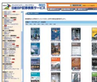
Nikkei BP (e-journals)