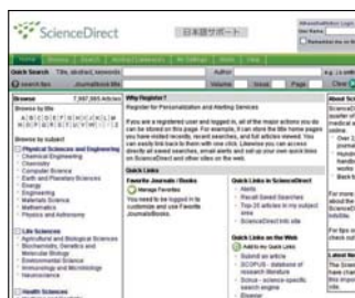
Elsevier website (e-journals)

E-journals and e-books are documents in electronic format that can be consulted online. They provide full-text access to the contents of a given article or book, typically through the homepage of the publisher or an online database.