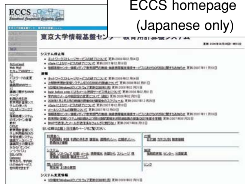
ECCS homepage (Japanese only)

Detailed information regarding information sessions and the registration procedure is posted on the ECCS website.